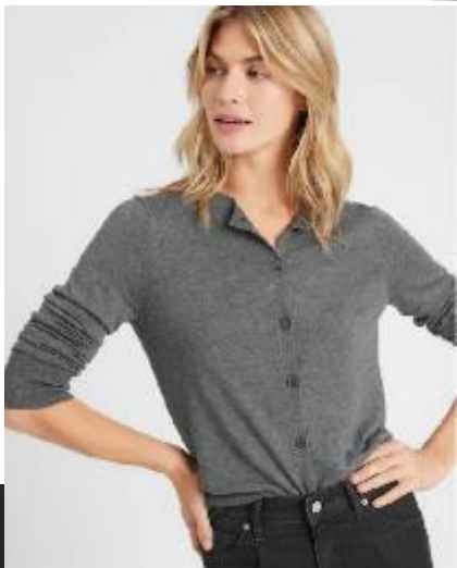
Modest Flattering Necklines