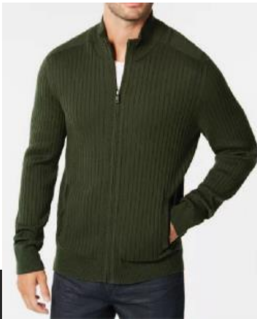
Shoulder Inserts & Piecing