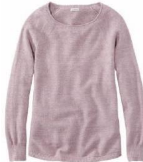
Longer Curved Hems