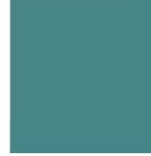
PANTONE® 17-4919 TCX Teal