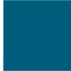
PANTONE® 19-4342 TCX Seaport