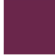
PANTONE® 19-2428 TCX Magenta Purple