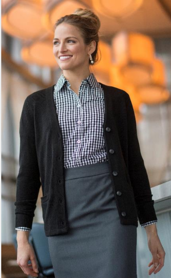
Ladies' Jersey Knit Acrylic Cardigan #7048