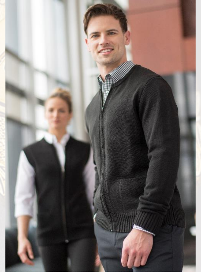
Heavyweight Full-Zip Vest & Sweater #4302/4372