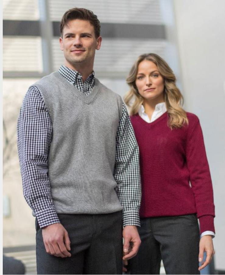
Jersey Knit Acrylic Vest & Sweater #4561/4565