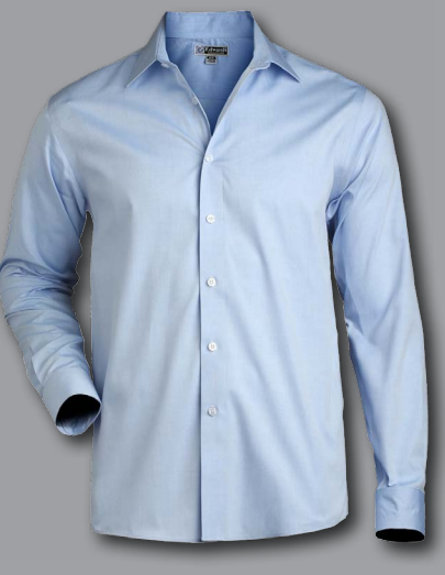
#1978/5978 Oxford Non-Iron Dress Shirt