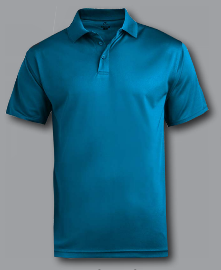
#1580/5580 Flat Knit Polo

Clubs | Boosters | Debate | Teachers | Tutors | Coaches | Administrator | Recruiter