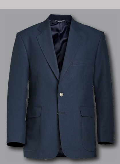
#3500/6500 Polyester Blazer