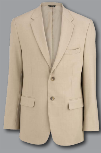
#3760/6760 Intaglio Microfiber Suiting