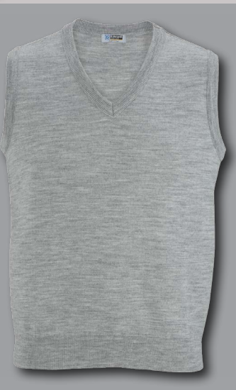
#165 Value Sweater Vest