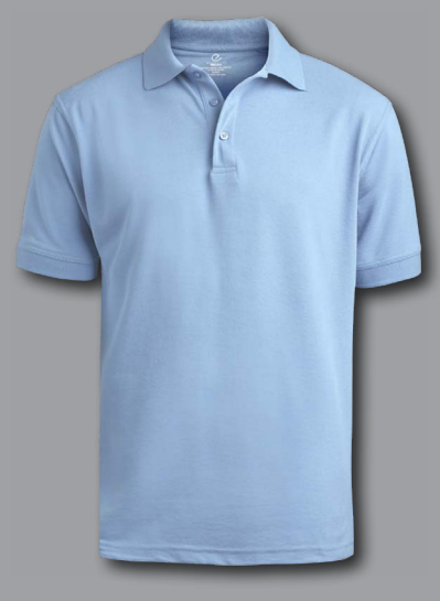
#1500/5500 Short-Sleeve Blended Polo

Clubs | Boosters | Debate | Teachers | Tutors | Coaches | Administrator | Recruiter