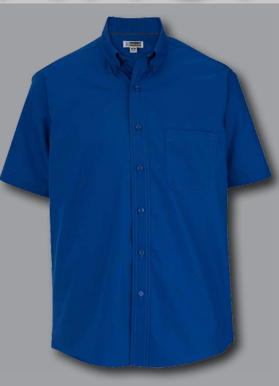
#1245/5245 Lightweight Poplin Shirt