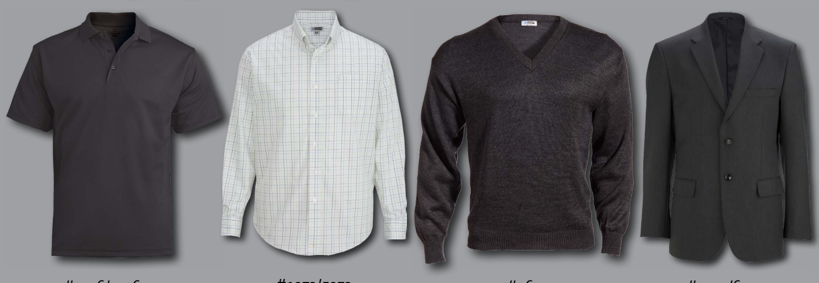
#1576/5576 Hi-Performance Mesh Polo

Clubs | Boosters | Debate | Teachers | Tutors | Coaches | Administrator | Recruiter