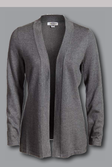
#7056 Open Cardigan