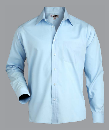
#1363/5363 Value Broadcloth Shirt

Safety Officer | Security Officer | Corrections Officer | Transportation Security Administrator | Gate Attendant