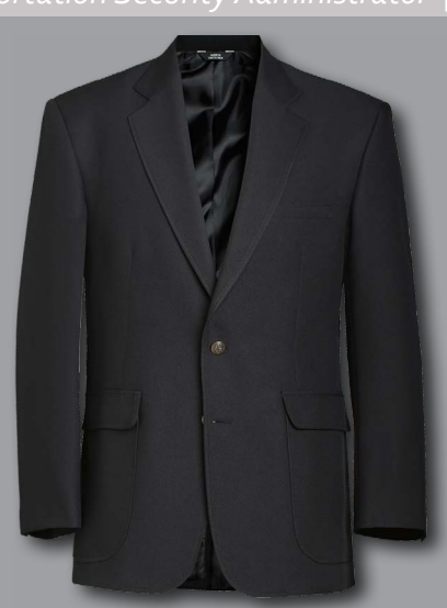
#3500/6500 Polyester Blazer