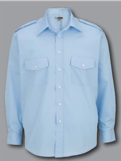
#1262/5262 Transit Shirt

Safety Officer | Security Officer | Corrections Officer | Transportation Security Administrator | Gate Attendant