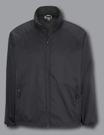
#3435/6435 Hooded Rain Jacket