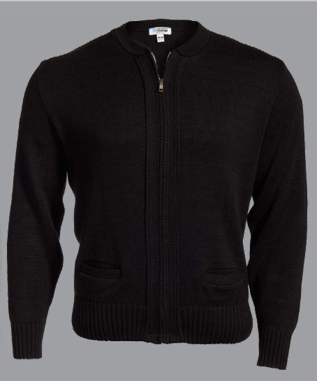
#372 Heavyweight Security Sweater