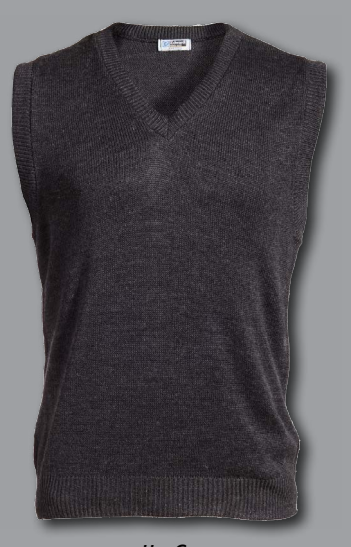
#561 Value V-Neck Vest