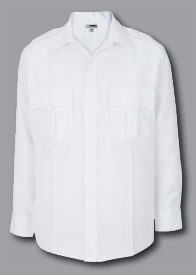
#1275 Polyester Security Shirt

Safety Officer | Security Officer | Corrections Officer | Transportation Security Administrator | Gate Attendant