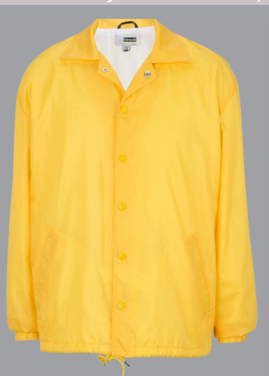
#3430 Coach's Jacket