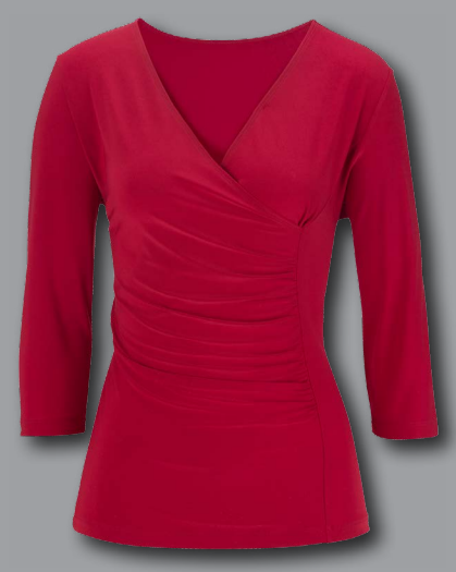
#5430 3/4-Sleeve Crossover Knit Top