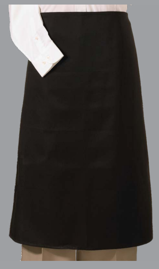
#9030 No-Pocket Bar Apron