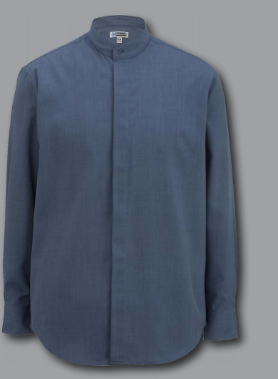
#1392/5392 Batiste Banded Collar Shirt