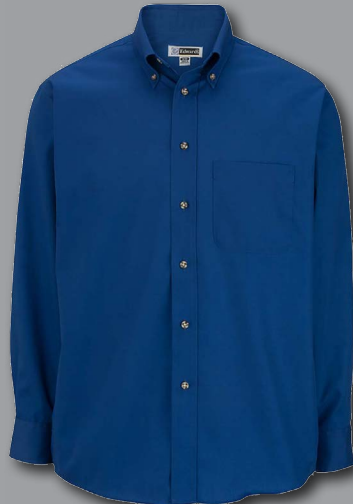
#1230/1280/5230/5280 Easy Care Poplin Shirt