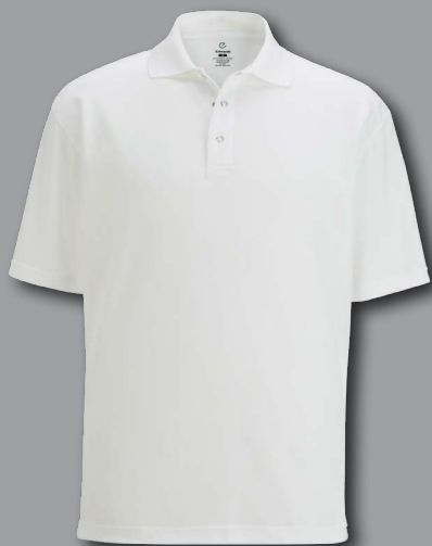
#1586/5586 Snap Front Polo

Cashier | Prep Cook | Manager | Front Counter | Drive-Through Window | Steward