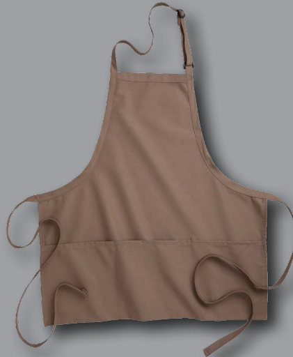
#9002 3-Pocket Bib Apron