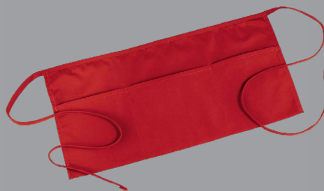
#9003 3-Pocket Waist Apron