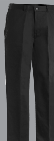
#2570/8579 Blended Chino Pants