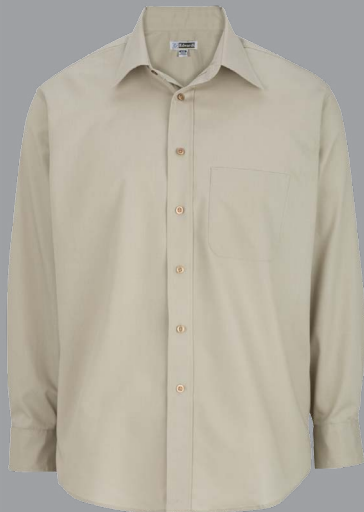
#1287/5037 Easy Care Poplin Shirt