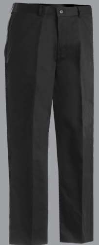
#2577/8567 Utility Pants