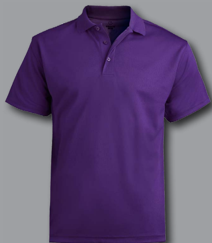
#1576/5576/5583 Hi-Performance Mesh Polo

Cashier | Prep Cook | Manager | Front Counter | Drive-Through Window | Steward