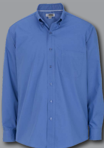
#1245/1295/5245/5295/5273/5040 Lightweight Poplin Shirt