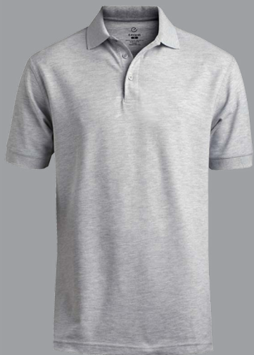
#1500/5500 Soft Touch Blended Polo

Cashier | Prep Cook | Manager | Front Counter | Drive-Through Window | Steward