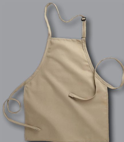
#9004 No-Pocket Bib Apron