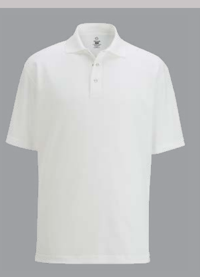
#1586/5586 Snap Front Polo