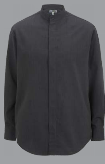
#1392/5392 Banded Collar Batiste Shirt