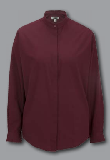
#1396/5396 Banded Collar Cafe Shirt