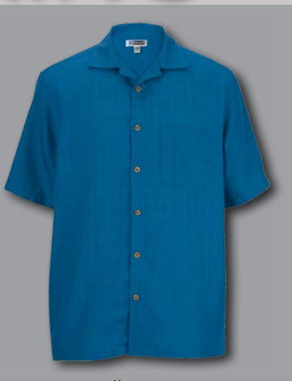
#1030 Jacquard Batiste Camp Shirt