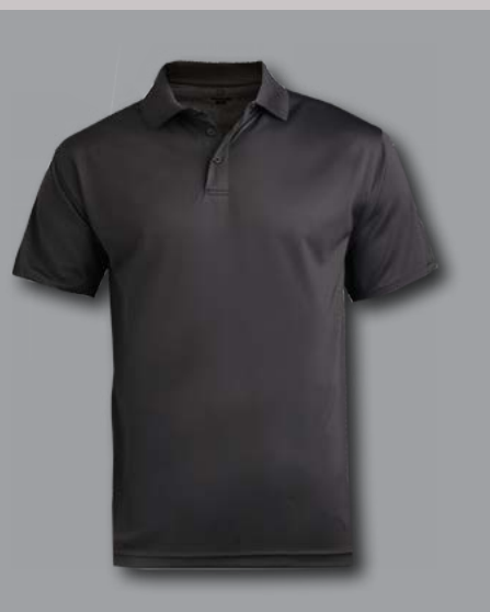
#1580/5580 Flat Knit Polo