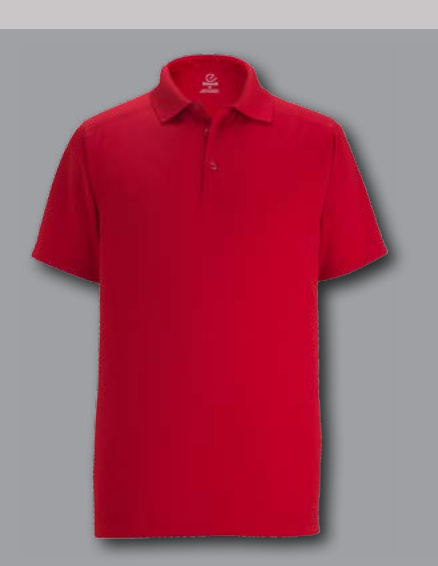
#1512/5512 Snag Proof Polo