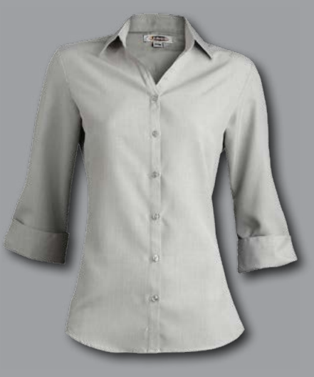
#1292/5292/5293 Batiste Shirt & Blouse