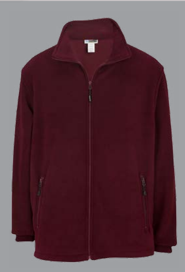
#3450/6450 Microfleece Jacket