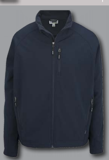
#3420/6420 Soft Shell Jacket