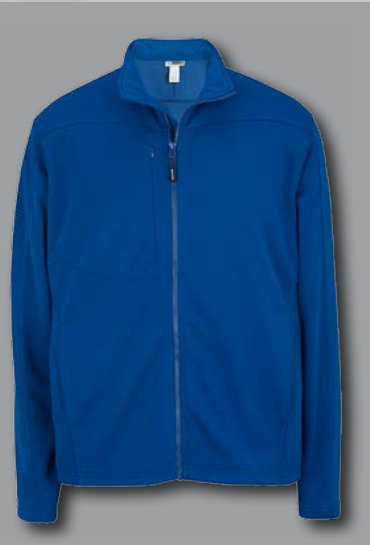
#3440/6440 Performance Tek™ Jacket