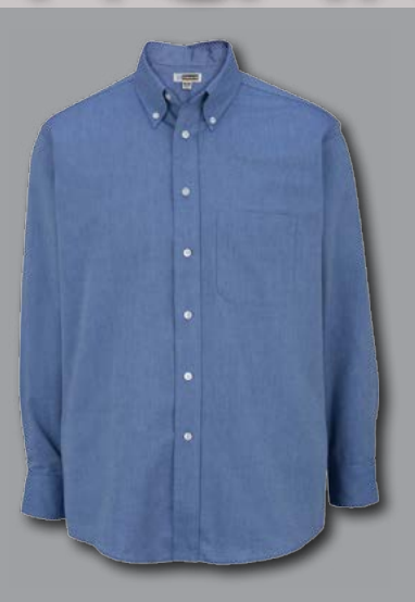
#1077/5077 Easy Care Oxford Shirts