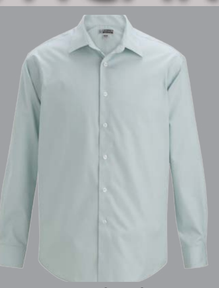
#1978/5978 Non-Iron Dress Shirt